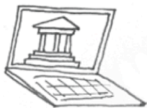
Free online courses